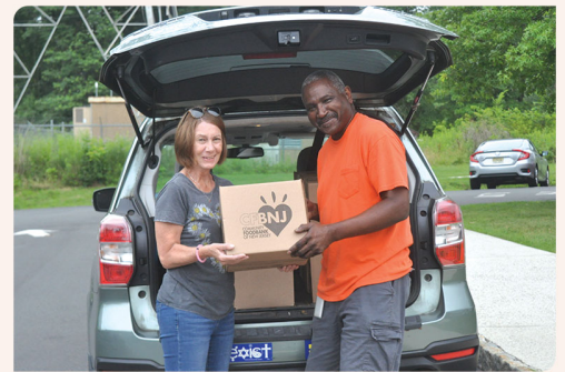
Cary picks up food from Pillar Elementary School to deliver to a student's home

"Your folks were so isolated and I was so isolated and volunteering allowed us all to feel connected with one another during that extremely difficult time. And by helping with things like PPE delivery it helped me to me supportive of the incredibly important work they do every single day. It helped me feel I was making a difference."