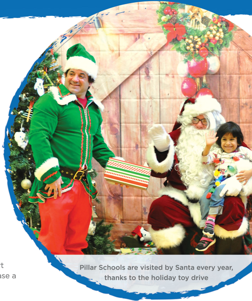
Pillar Schools are visited by Santa every year, thanks to the holiday toy drive

Beginning this year, the fund will support grants of $500 or less to help program families facing a significant and unexpected expense. Recent grants helped a parent repair her car so she could transport her child to her program and helped a family purchase a protective helmet not covered by insurance.