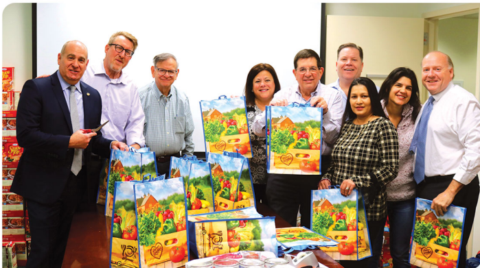
Volunteers packing up Thanksgiving baskets for Pillar Care families